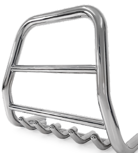
Product Name : HIGH WITH SUMP Product Code : BBYK