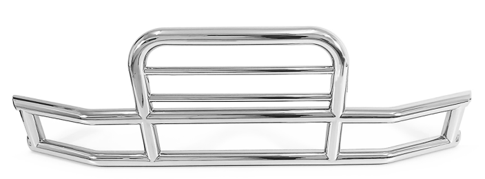
Product Name : Front Guard USA Type Product Code : BBTUS