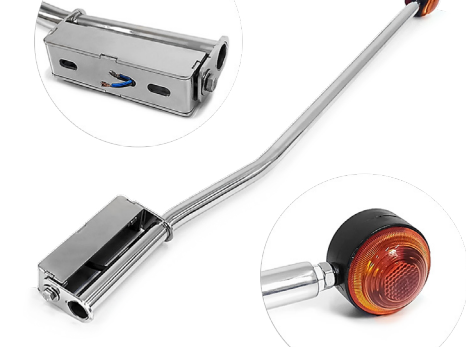
Product Name : TRUCK FLAG PIPE Product Code : MTBD