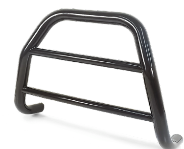
Product Name : HIGH WITHOUT SUMP Product Code : BBY