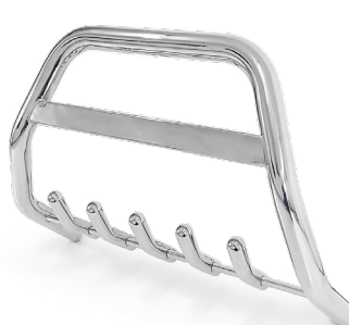
Product Name : LOW WITH SUMP & NAME PLATE Product Code : BBAYK

Product Name : LOW WITH SUMP Product Code : BBAK