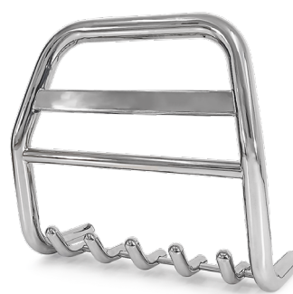
Product Name : HIGH WITH SUMP & NAME PLATE Product Code : BBYKY